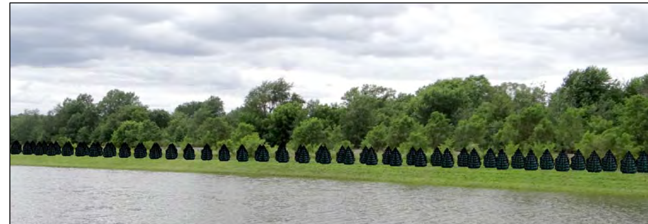
EXAMPLE OF HEARTHSTONE EAST DETENTION POND LANDSCAPE SCREENING