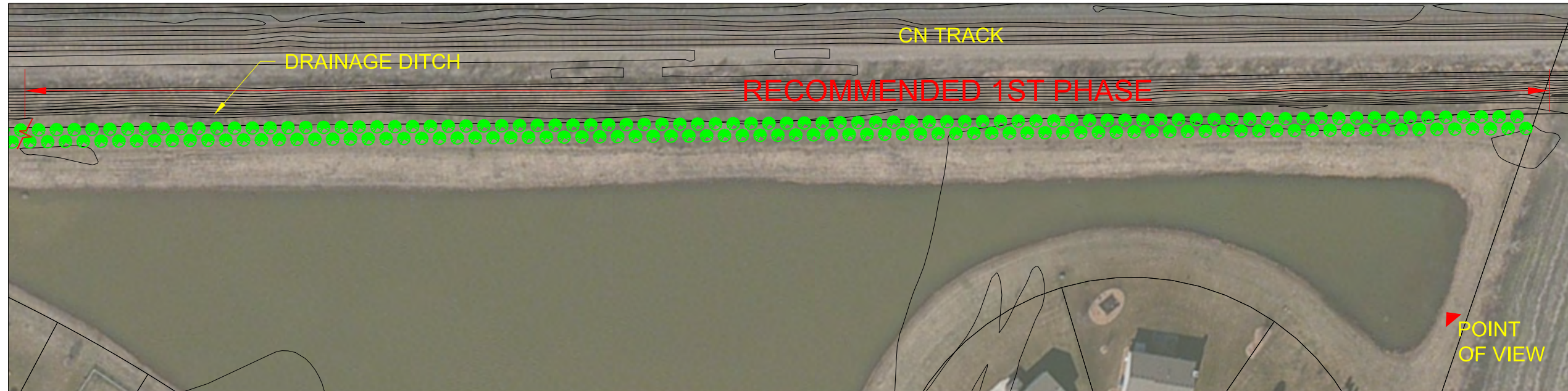
FAR EAST PORTION - HEARTHSTONE DETENTION POND (1,271 lf)